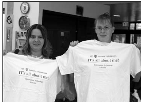
Students scoop up cool, free stuff at the MITH Fair.

A tremendous effort on everyone's part resulted in a successful fair and a fun day for students, faculty, and staff. Our thanks to those who helped us make this event a hit.